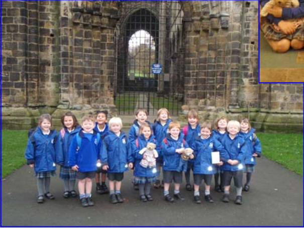
PP2 Trip to Abbey House Museum for a workshop on toys as part of their class project.