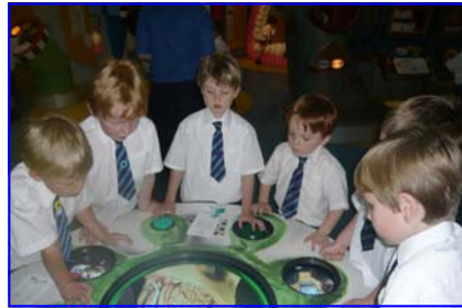
PP3 Trip to Eureka! Learning all about our teeth and how the brain works.

The Harvest Festival was the opportunity for the children to entertain parents and guests with a range of music and readings. The generous donations of fresh produce and tinned goods were donated to the Salvation Army in Bradford.