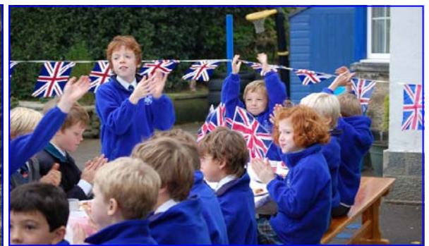
Former pupils launch the Jubilee Year